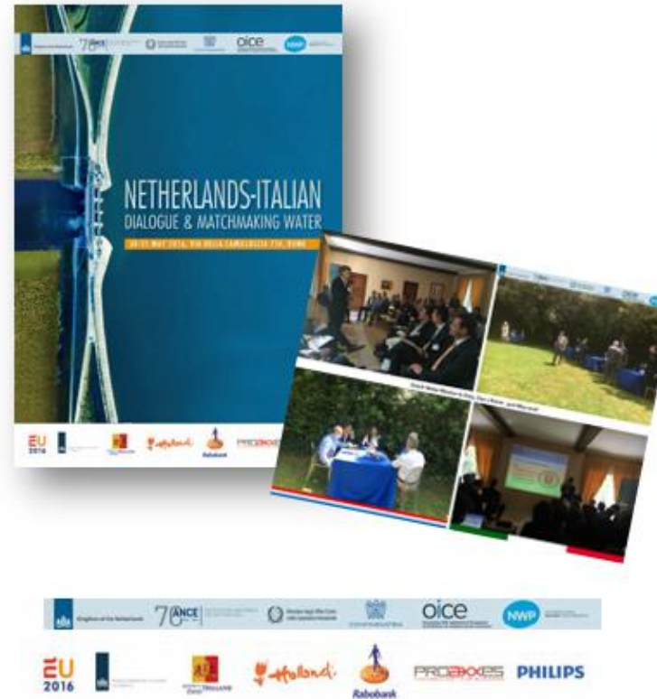
Netherlands – Italian Dialogue & Match Making WATER, Rome May 2016