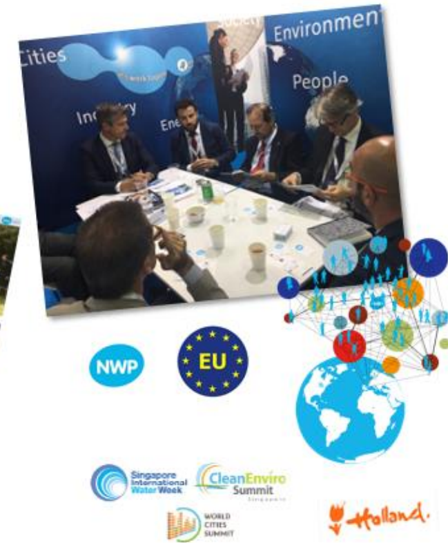
Dutch – Italian talk – export AESAN region, wsc, siww 11 July 2016